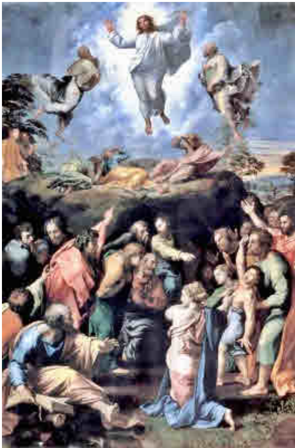
Rafael The Transfiguration